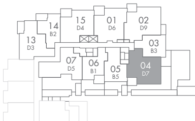
LEVEL 3 LARGER PATIO ON LEVEL 3